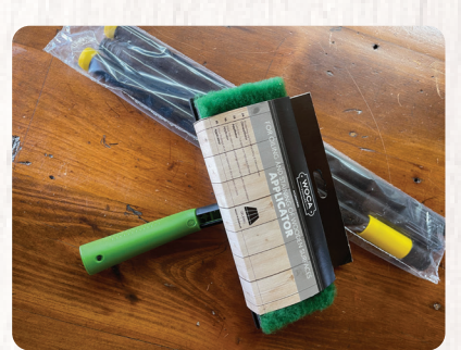
Applicator & Handle

Deck-Max Architectural We are the market leaders