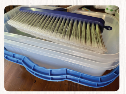
Bucket & Broom

The only recommended oil to be used on Bamboo is WOCA oil - this can be found in many tinted colours and offer a very natural oil and does not leave a skin on the surface.