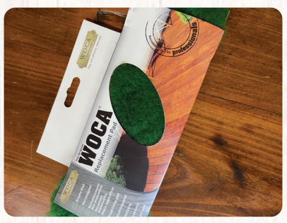
Replacement Applicator Head