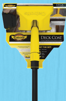
Applicator and Handle